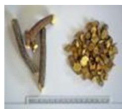
Figure 1. A photograph of dried root of Glycyrrhizae uralensis Fisch .

Pao Zhi (processing) is a very important procedure in Chinese herbal medicine. As well known, processing procedures such as stir-baking, steaming, and calcining may modify many properties of the herbs, such as efficacy and safety. According to the pharmacopoeia and related literatures, till now, no difference can be found via Thin-Layer Chromatography (TLC) in herbals treated with and without processing. Only few fluorescent spots of the same position and colors between sample and reference in the TLC were selectively compared.