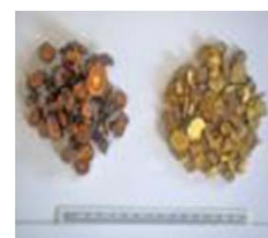
Figure 2. A photograph of Radix Glycyrrhizae praeparatae (left) and Radix Glycyrrhizae (right)